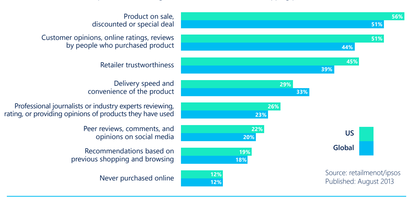
Fig. 1. Consumers' purchase influencers when shopping online

Percent of respondents indicating what influenced their online shopping purchase decisions.